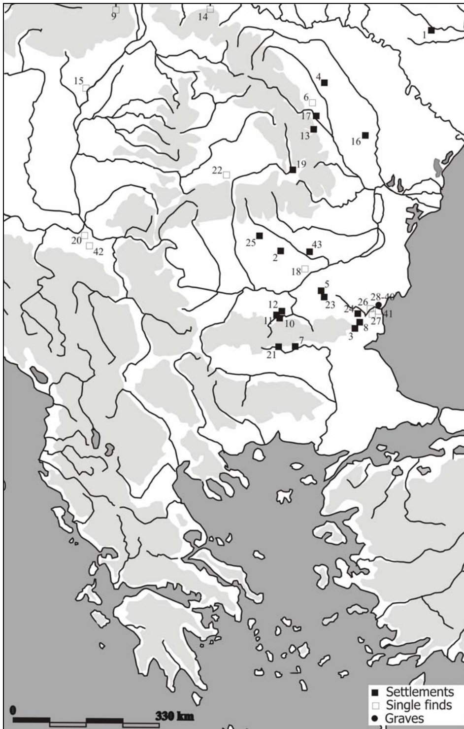
Fig. 1. The spreading of the Vidra type axes in South-East Europe. Răspândirea topoarelor de tip Vidra în sud-estul Europei.

Some observations on the Vidra type axes. The social significance of copper in the Chalcolithic